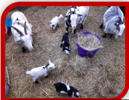
Some new arrivals on the Horn farm