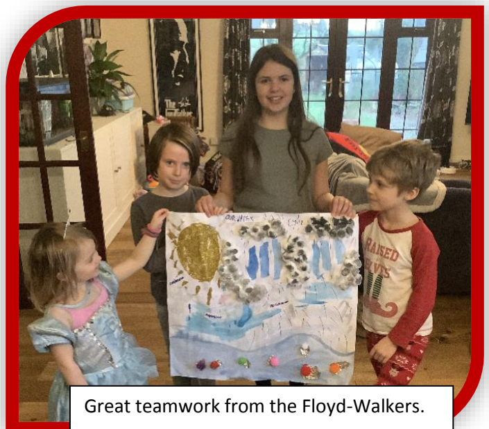
Great teamwork from the Floyd-Walkers. (Christmas pyjamas are not just for Christmas!)