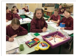
Year 5 have been working hard on their decimals.